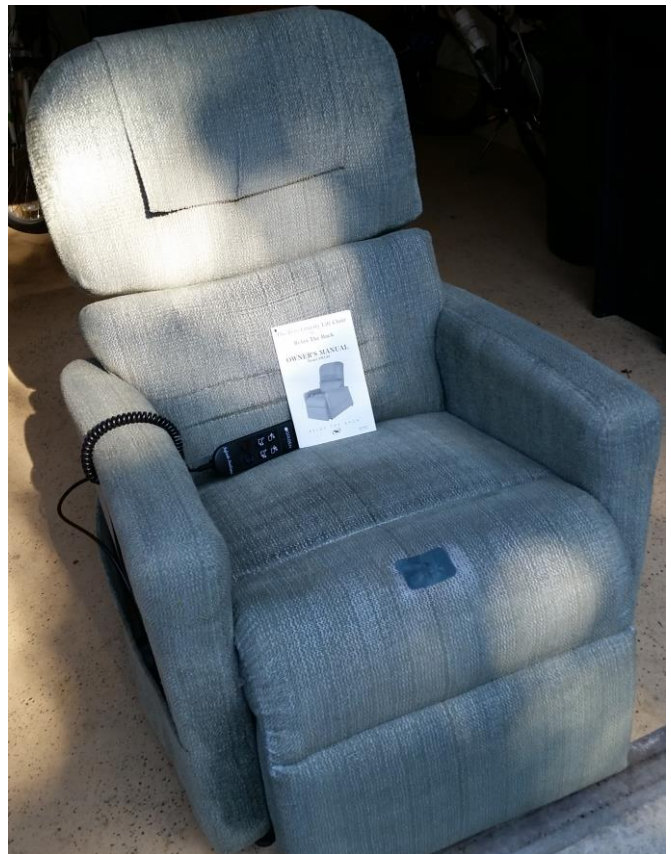
Lift Recliner: Purchased at Relax-a-back, Lays flat, located in Burnsville