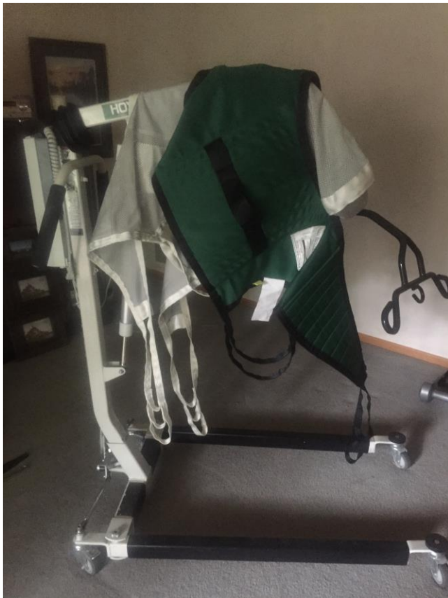
Hoyer Lift: Invacare brand, electric, Woodbury